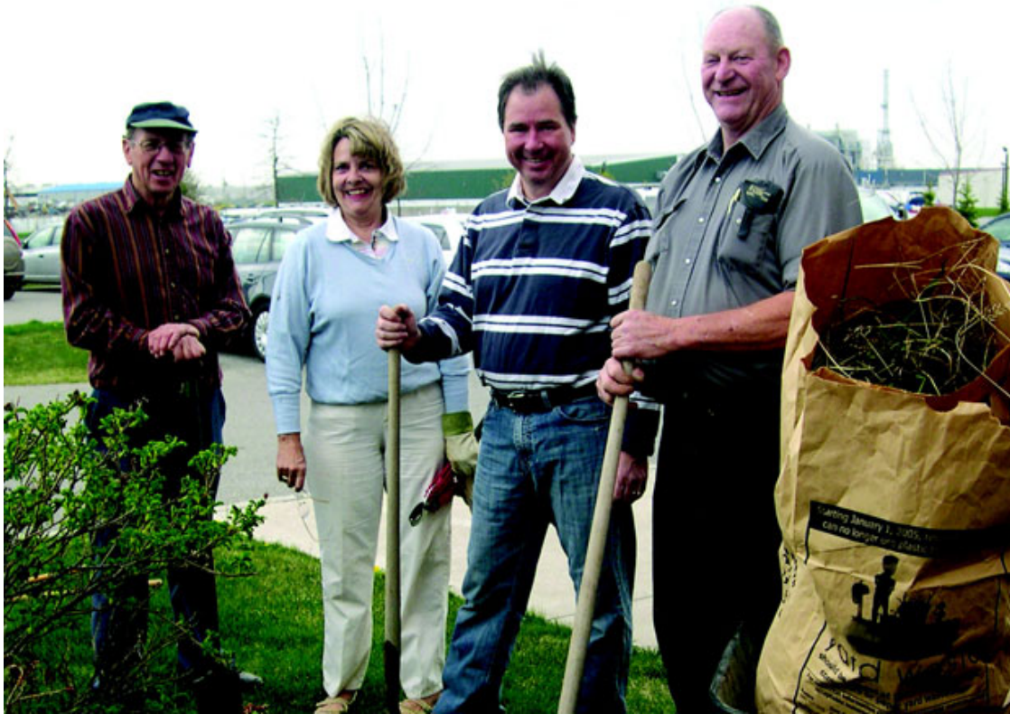
Maple tree planting on Canada Day Sunday.